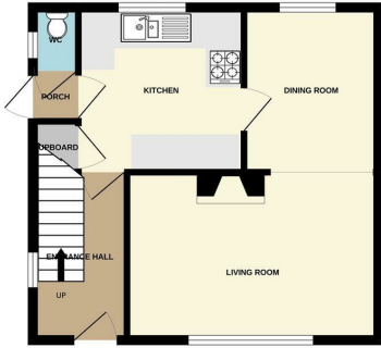
GROUND FLOOR 390 sq.ft. (36.3 sq.m.) approx.